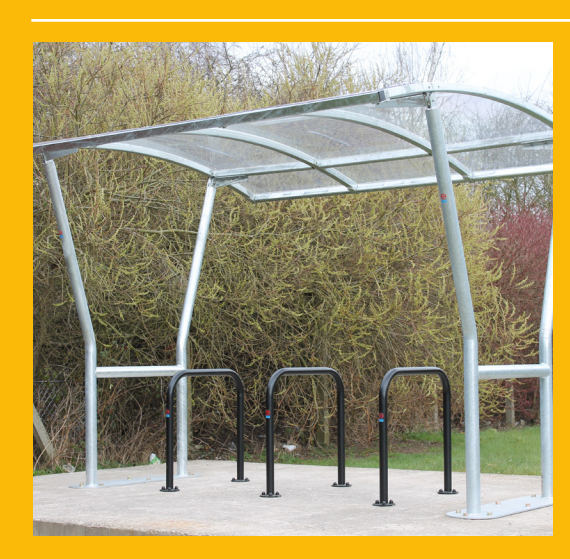
Additional extension bays available to purchase