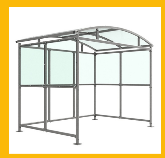
Additional extension bays available to purchase