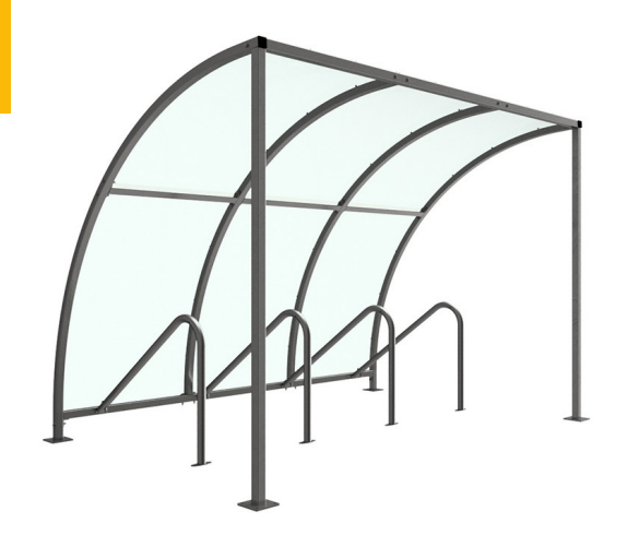
Additional extension bays available to purchase