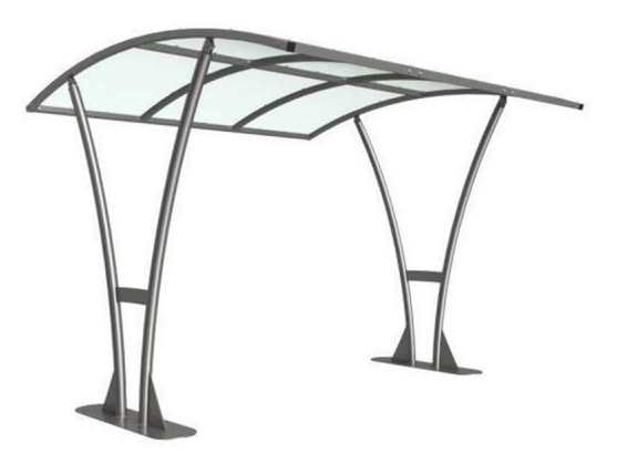
Additional extension bays available to purchase