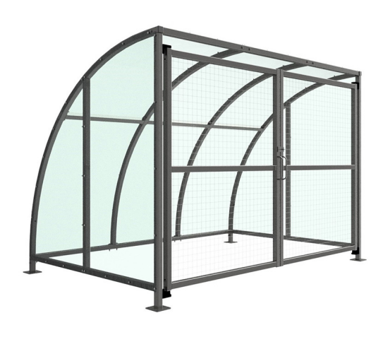
Additional extension bays available to purchase