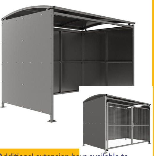
Additional extension bays available to purchase